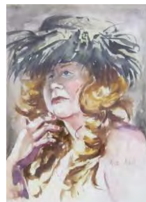
Jill Mail's lovely soft water colour painting 'My Favourite Hat' took out the Just Picture This $100 framing voucher.