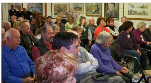
The Queanbeyan City Council Art Exhibition always attracts good entries and the big crowd appreciated one of the best Council Exhibitions.